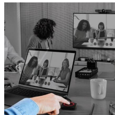
Barco ClickShare Conference CX-20/CX-50