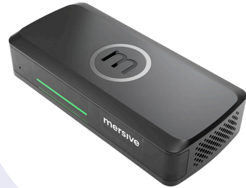
Gen4 Mini, included with Mersive Essentials

Prepare your team for future innovations with upcoming broadcast notifications and AV routing features, ensuring your investment continues to deliver as technology evolves.